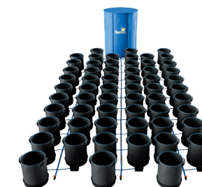
60Pot XXL 50 (50L pot - excl. adaptive collar)