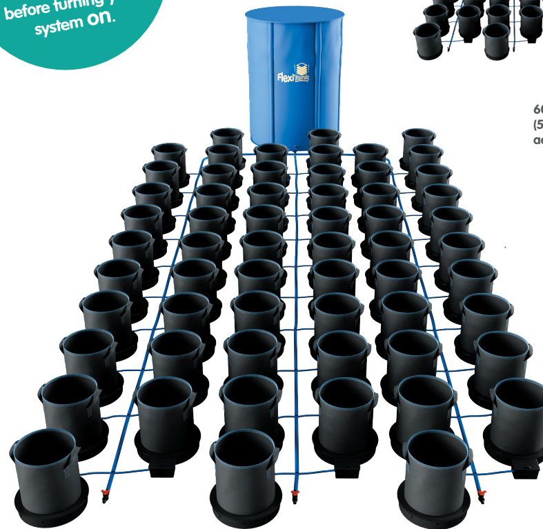
60Pot XXL 35 (35L pot - incl. adaptive collar)