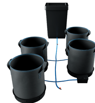
4Pot XXL 50 (50L pot - excl. adaptive collar)