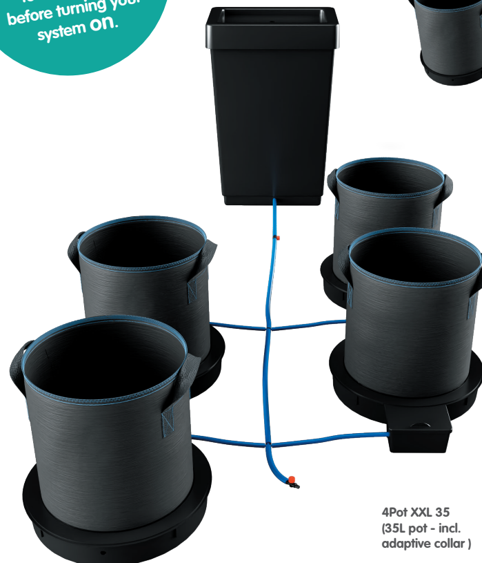
4Pot XXL 35 (35L pot - incl. adaptive collar)