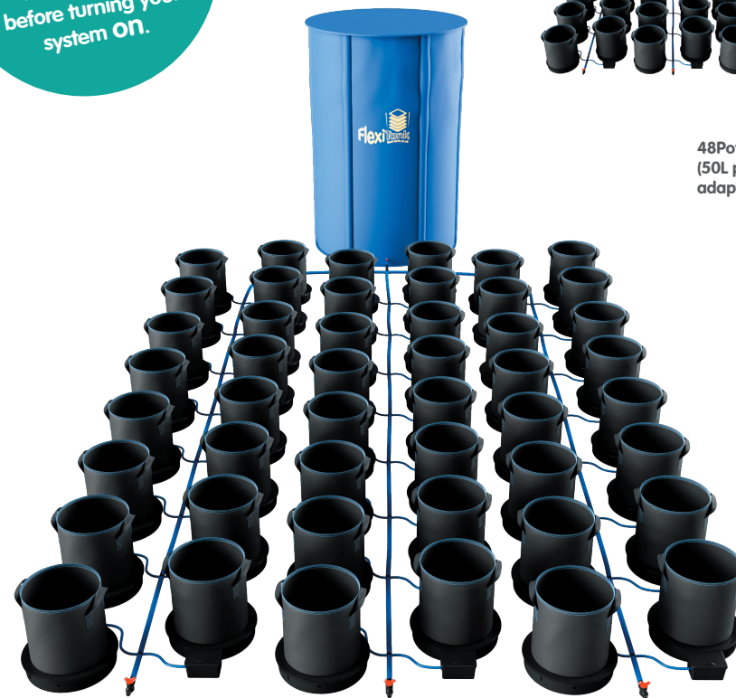
48Pot XXL 35 (35L pot - incl. adaptive collar)