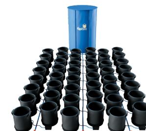
48Pot XXL 50 (50L pot - excl. adaptive collar)