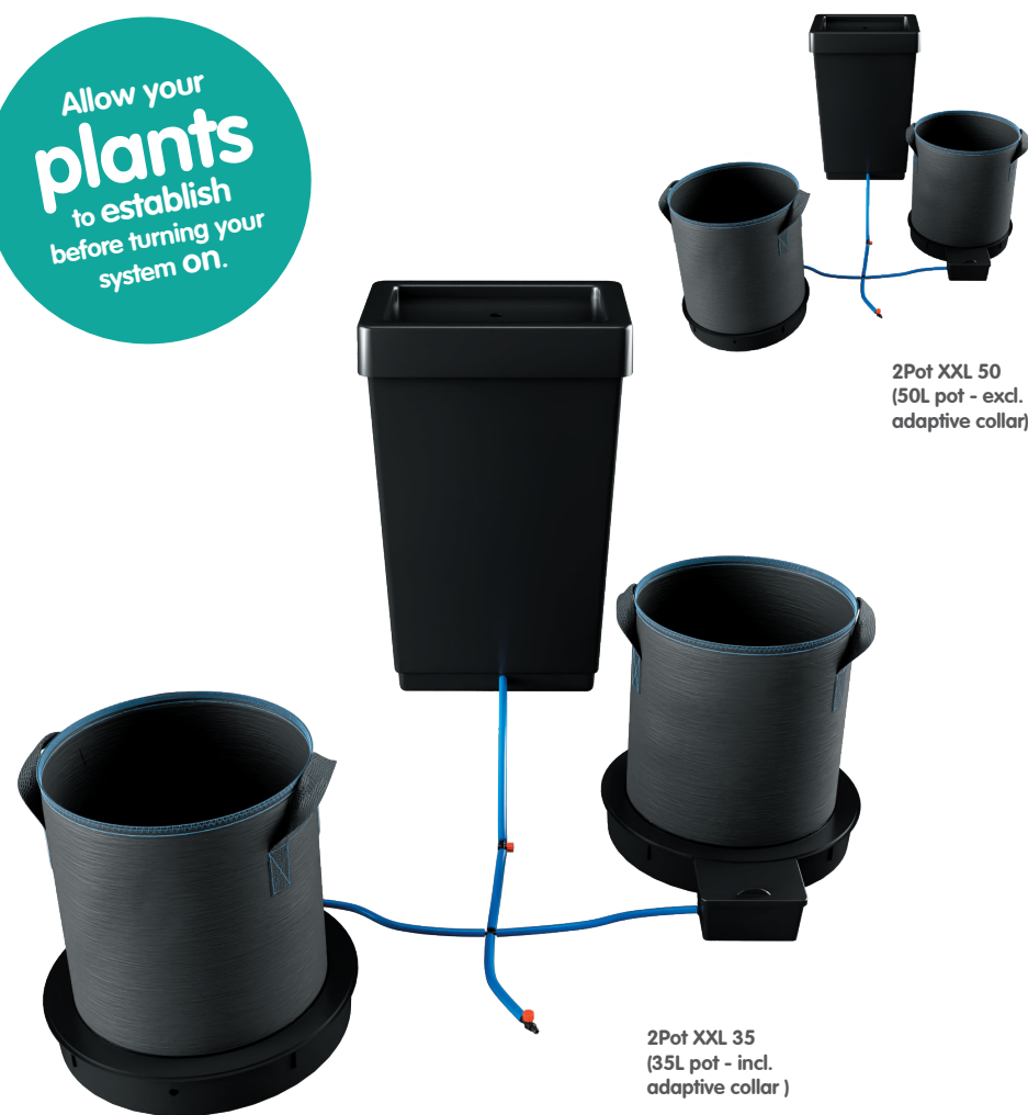
2Pot XXL 50 (50L pot - excl. adaptive collar)