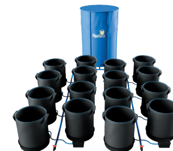
16Pot XXL 50 (50L pot - excl. adaptive collar)