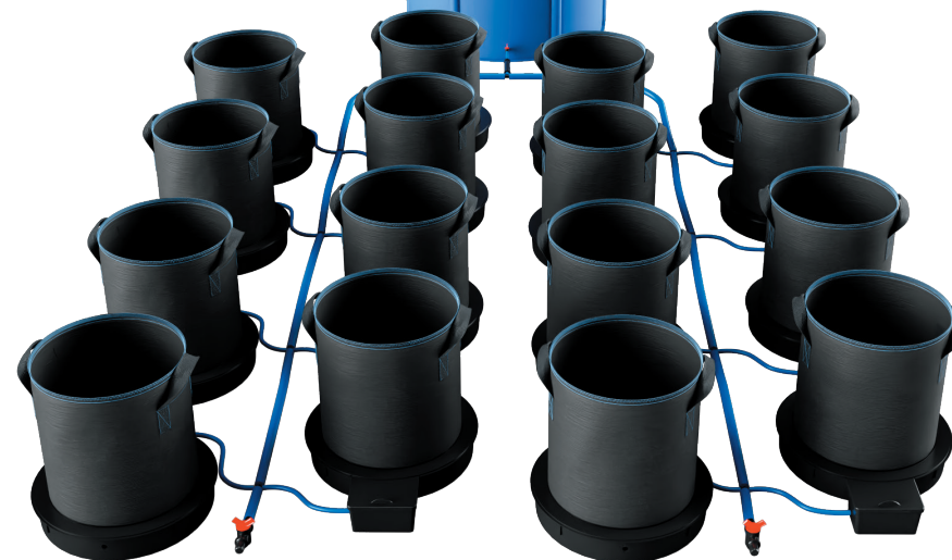
16Pot XXL 35 (35L pot - incl. adaptive collar)