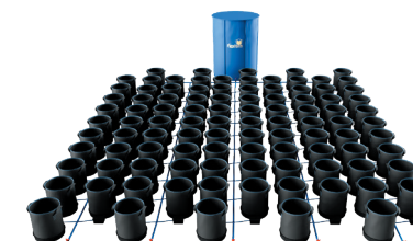
100Pot XXL 50 (50L pot - excl. adaptive collar)